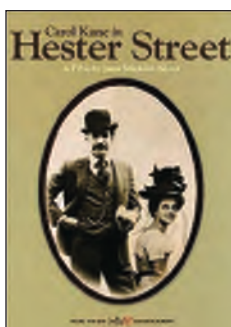
Early 20th Century

While some of you may never visit the Lower East Side, a great number of films set there provide a good sense of its changing flavor throughout the years. Get a feel for its changing history. Watch the following three films. Isn't it interesting how things have changed?