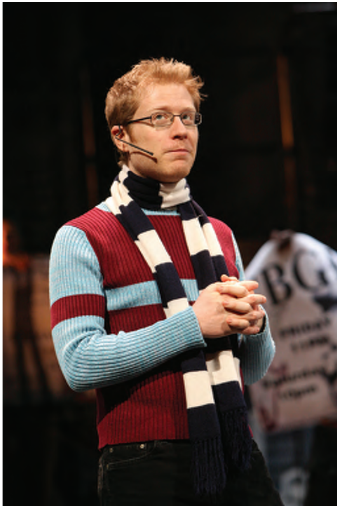
Anthony Rapp as “Mark Cohen” in Rent: The Broadway Tour .

StageNOTES: As an original cast member of Rent , you were involved with the workshop that created what we experience today. What was that like to be in it from the beginning?