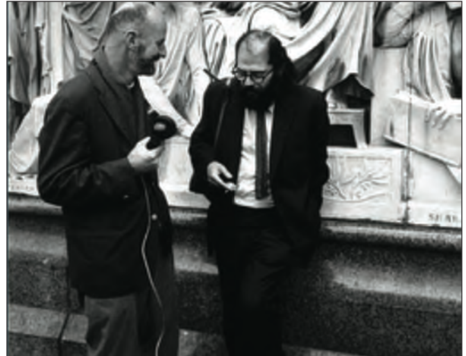
Allen Ginsberg (1926-1997), voice of the Beat Generation, is being interviewed by fellow poet Lawrence Ferlingetti on the steps of the Albert Memorial in London.

The streets are still lined with cafés and shops and although the creative souls who helped to form the neighborhood are no longer able to afford to live in it, the vibe and energy they helped to establish still exists to this day.