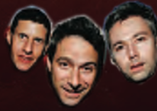
THE BEASTIE BOYS